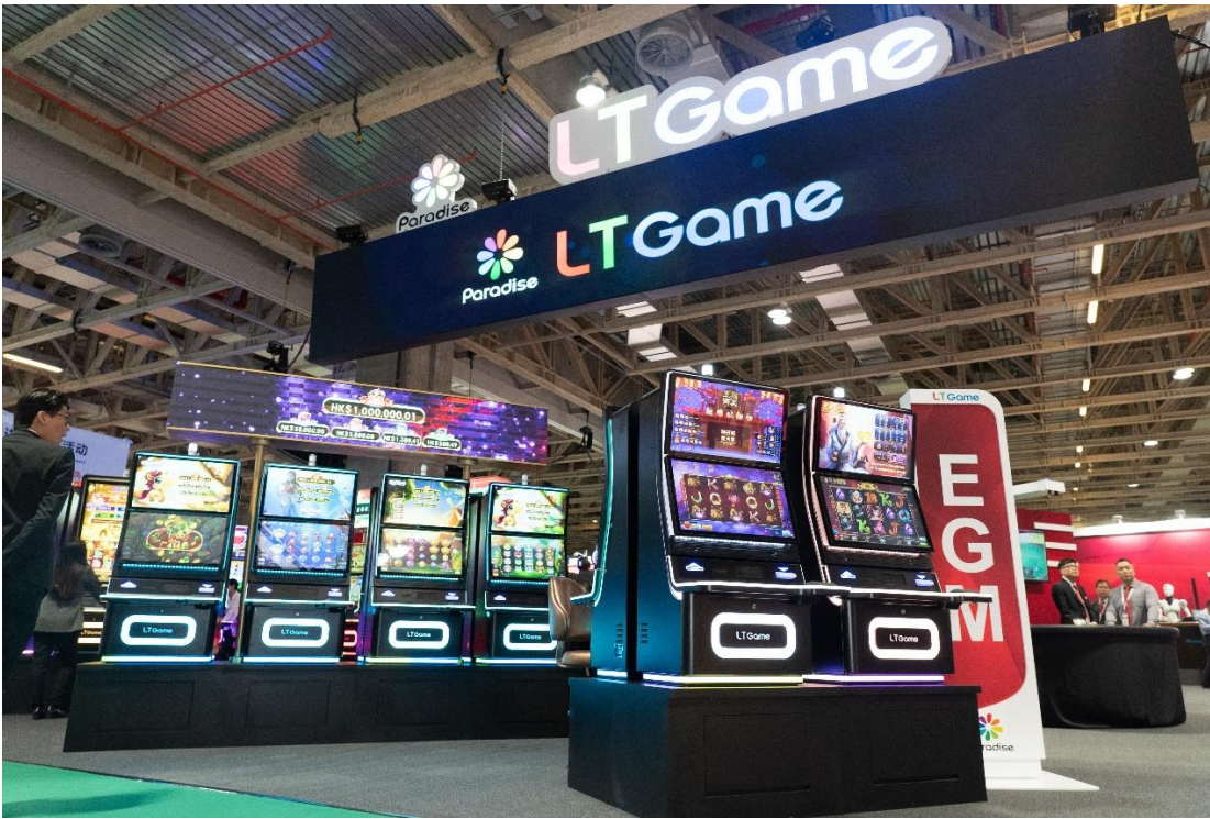
Paradise exhibits its latest slot machines and new slot games