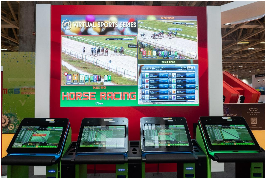
Paradise's latest Virtual Horse Racing Gaming fascinates players