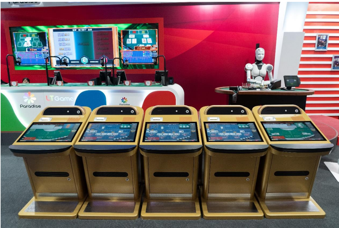
Paradise's flagship products LMG and other high-tech gaming equipment receive remarkable applause